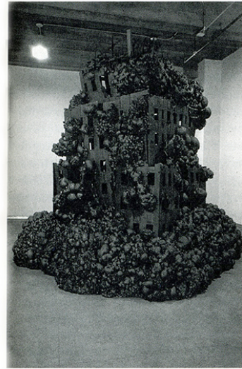
4-2 Heide Fasnacht | Demo , 2000

Intriguingly, Demo manipulates the dimension of time on multiple levels. First, there is the (rapidly moving) time of the actual explosion; second, the (stopped) time of the artwork's depiction; and third, the (much slower but still moving) time of the