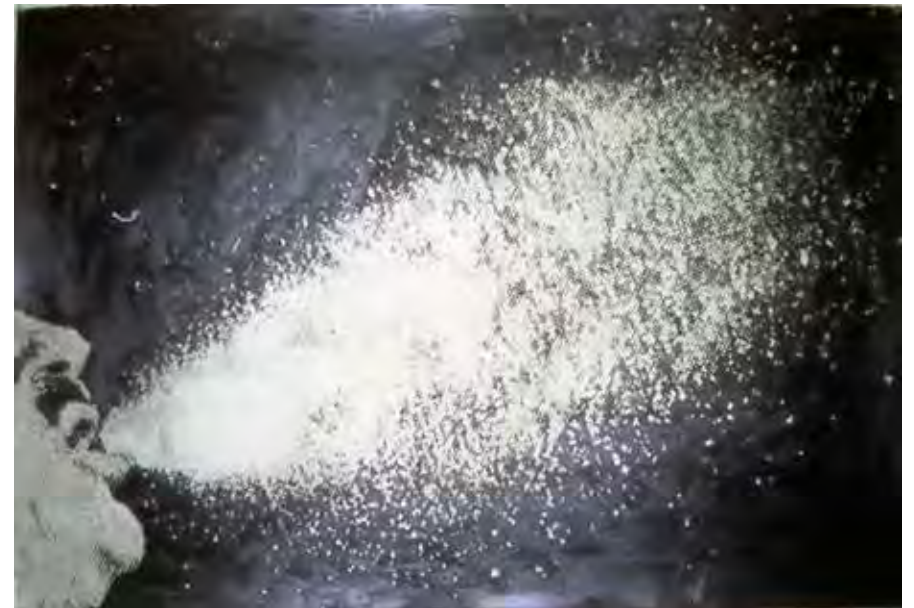
Above: Blast , 1997-1998, Graphite on Paper, 22" x 30"