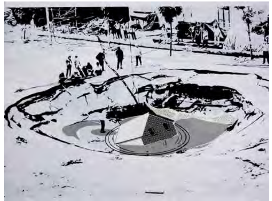
Above: Suspect Terrain (Artist's Rendering)

“I take the collapse as a plan to reconstruct in however fractured a fashion. These become