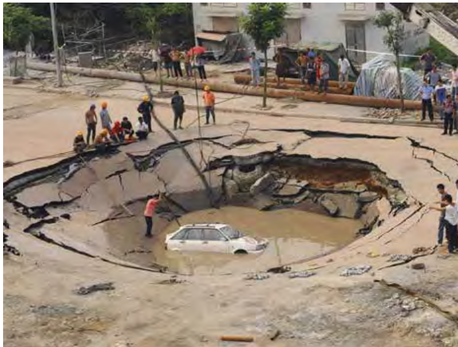
Above: Source image of sinkhole in Guatemala City

sinkholes, including the 26' wide by 52' deep pit created in the Shenzhen region of China in 2013 and the 2010 occurrence in Guatemala City, Guatemala, which spanned sixty feet wide and approximately thirty stories deep. By sculpturally depicting these devastating geological occurrences, Fasnacht turns the relationship between event and documentation into a personal and precarious action.