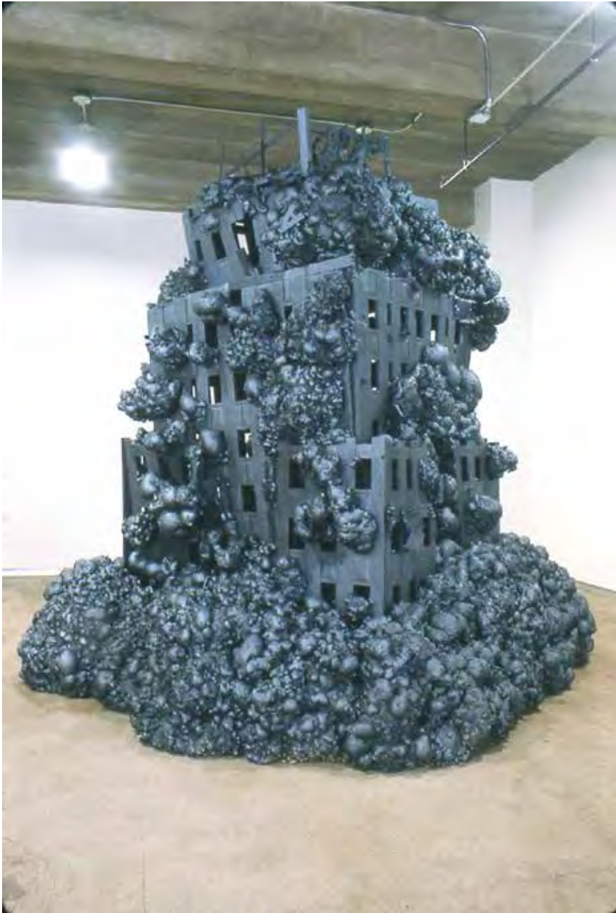
Above: Demo , 2000, Polychromed Neoprene, Styrofoam, 112" x 125" x 120"